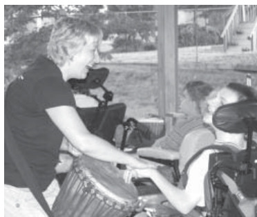
Enjoying the drumming summer concert