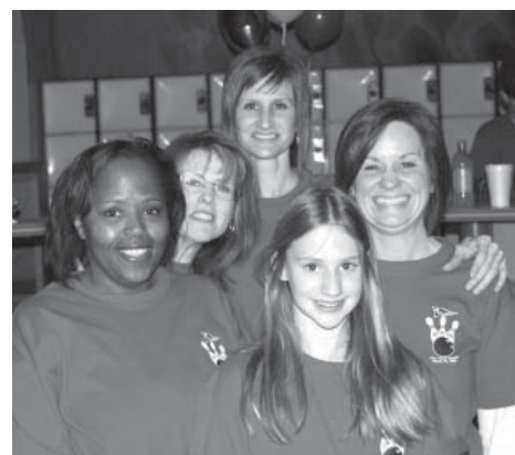
Holy Angels nursing staff team takes to the lanes at Angel Bowl.