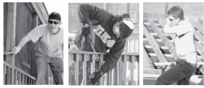
Pi Kappa Phi fraternity brothers build, stain and stabilize structures at Camp Hope.