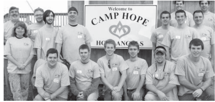
Pi Kappa Phi fraternity brothers from area universities work on projects at Camp Hope during Give-A-Push Weekend.