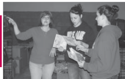
Members of the Charlotte Catholic High School Freshman class help us get ready for the Angelic Apparel Sale.