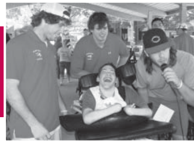
Members of the Belmont Abbey College Lacrosse Team host the end of school year field day for Holy Angels residents.