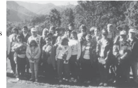
Great Adventures members always have a great retreat weekend when visiting Maggie Valley.

Twenty years ago, it all started with an idea . . . an idea to provide adults with intellectual challenges the opportunity to be with friends, have fun, expand their social horizons through travel, sports, health and wellness activities and spirituality through retreat opportunities.