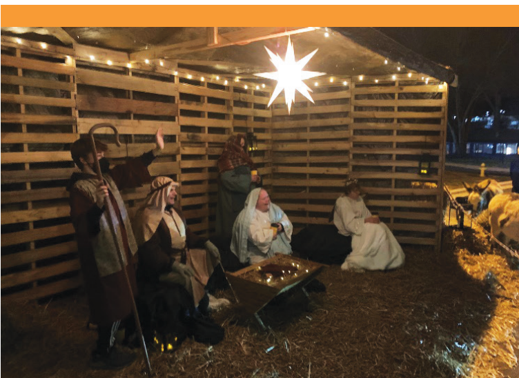
Holy Angels residents participate in the Nativity scene during Share the Light.

Three years ago, one of Holy Angels fervent and loyal supporters brought to us a vision of bringing our community together during a time when our world needed joy, hope and light. This year, we are excited to continue this Christmas tradition and invite you to share in spreading the light to the community.