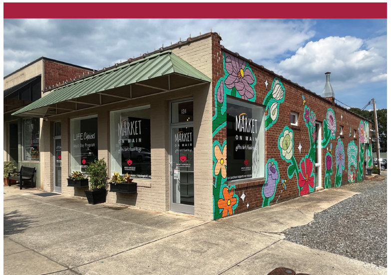
The new building for Life Choices and Market on Main in Belmont.

Please visit us at 124 N. Main Street in Belmont. Check out Life Choices, grab a sandwich and do your holiday shopping at Market on Main.